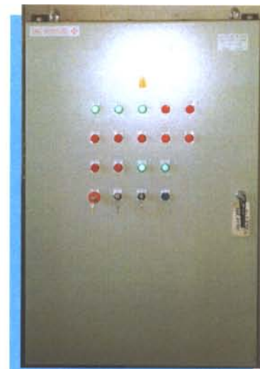
AFR5 enclosure monitors deceleration Braking system is at turn-key solution