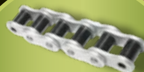
Standard & solution transmission chains